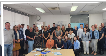
Melbourne Network Event