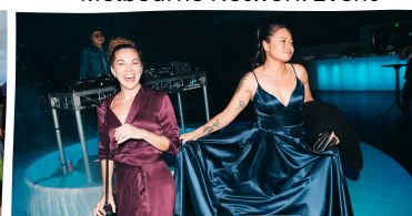
Two Good Charity Event