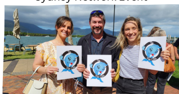
Cairns Workshop & Network Event