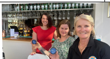
Sydney Network Event

If you would like to host a WISA event in your local area contact us here .