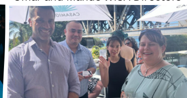
WISA friends in Sydney