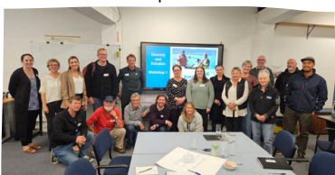
Fremantle Network Event