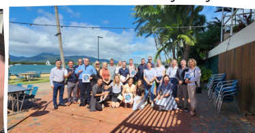
Cairns Workshop & Network Event